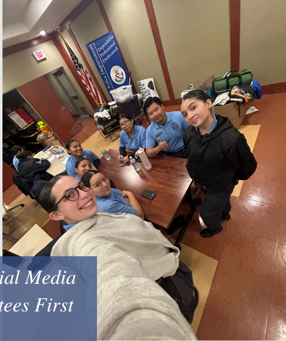
The Social Media Committee's First Meeting