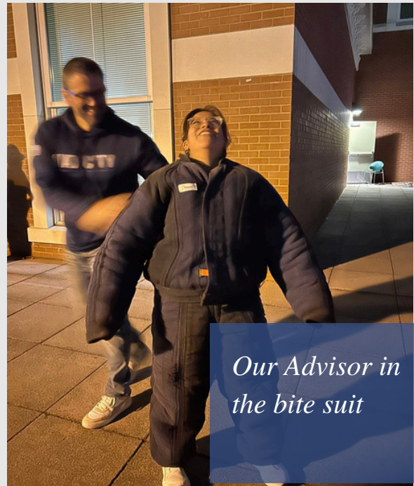
Our Advisor in the bite suit

On November 7, at our weekly meeting, the Post held nominations for the 2025 elected positions. These positions are our post Treasurers, Secretaries, Vice President, and President. All four positions are important to the dynamic of our program and its function. We started this process by explaining each position's responsibilities and ensuring everyone who accepted the offer would be prepared for the workload. Treasurer's have 3 candidates, two Cadets are running for Secretary. 3 Cadets are running for Vice President. And 2 Cadets are running for President. We wish the best for the nominated candidates and are delighted to see the results after the Speeches on December 5th.